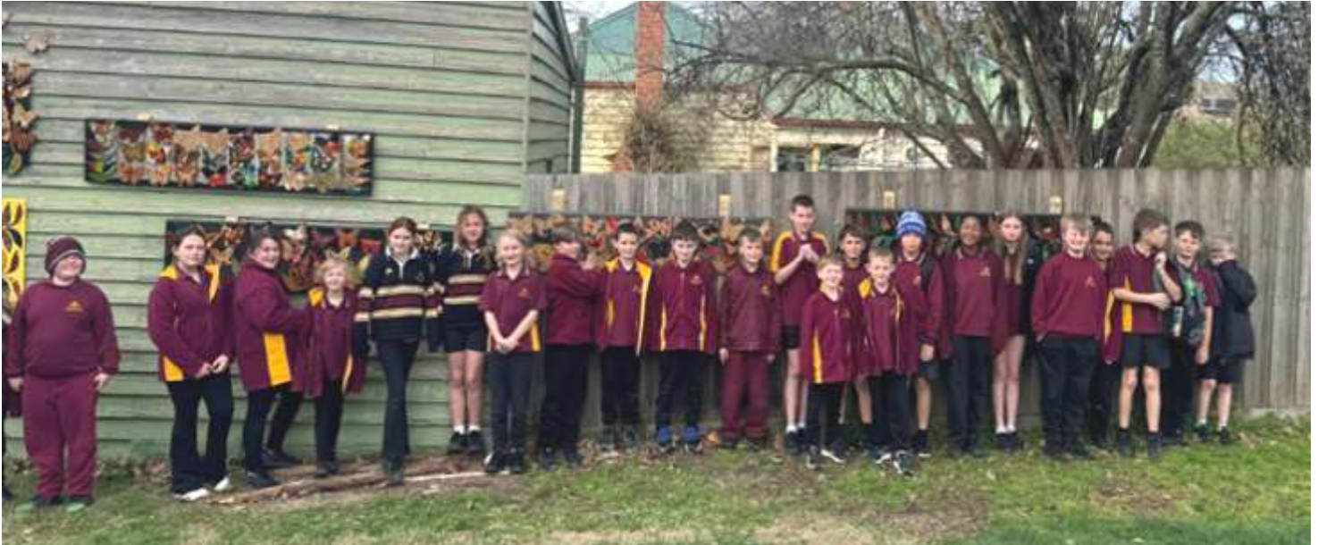
Some of the students visiting the Creswick Neighbourhood Centre to celebrate NAIDOC Week

It has been a nice start to Term 3 despite the cold weather. The school is fortunate to have a large undercover area so students can still get outside and have a play at recess, even on wintery days.