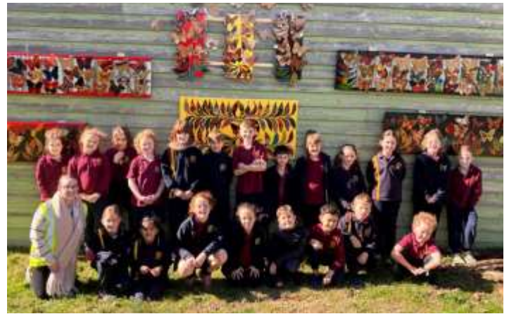
Students at the Neighbourhood Centre