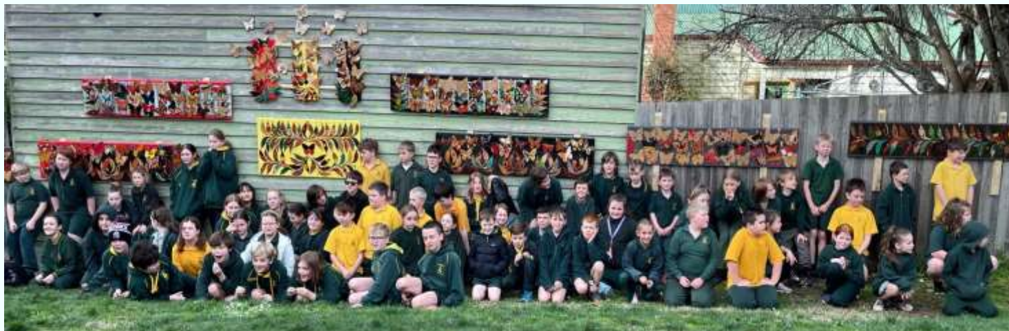
Creswick Primary School