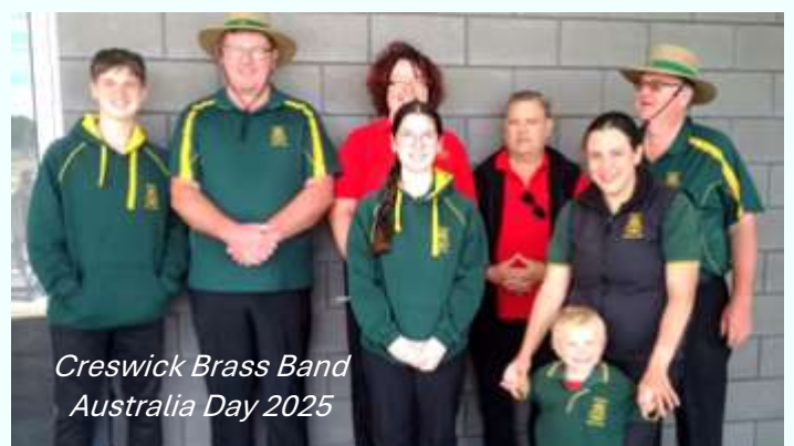
Creswick Brass Band Australia Day 2025