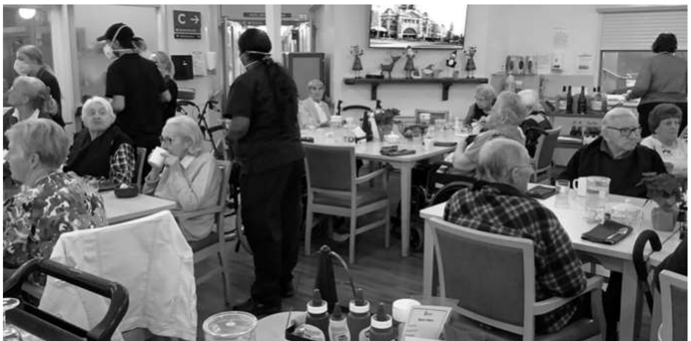
John Curtin dining room