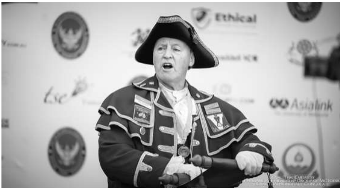
Photo reproduced with the permission of the Honorary Consul, Tessa Sullivan