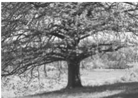
Algerian Oak at Bullarook Streamside Reserve (Kerrins Bridge).

Trees of Significance - the history and outstanding beauty of the Avenue will always be the main drawcard for visitors to Kingston, however other old trees in the village also have interesting