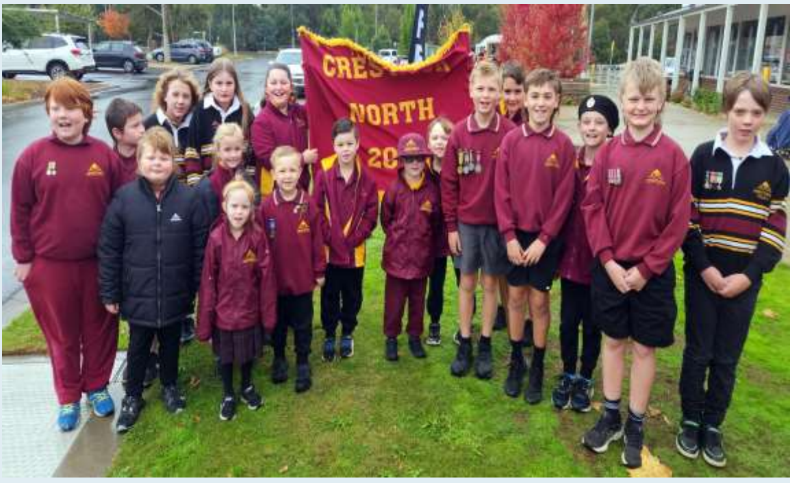
Creswick North PS students preparing to march in the parade on ANZAC Day.

After-School Program runs every weekday from 3.30pm – 6.00pm and the OSHClub organise lots of great activities for the students including cooking, craft and science.