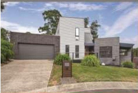
3 Lindsay Court, Creswick