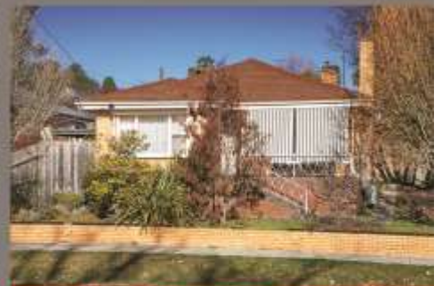
24 Raglan Street, Creswick

Positioned on a corner allotment with rear access, it's ideally located within walking distance of local primary schools and bus stops and all that the lovely township of Creswick has to offer.