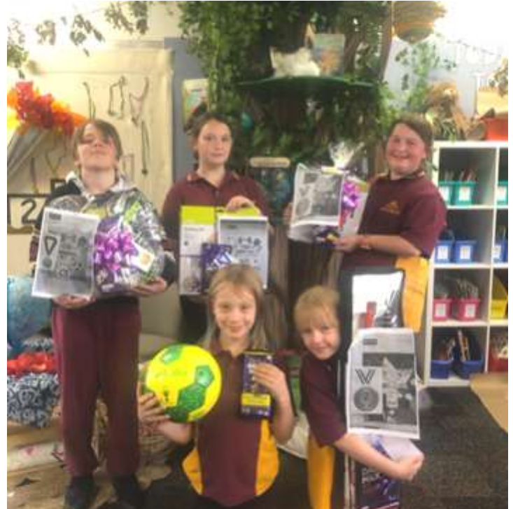
Some students with their winning entries in the local Creswick IGA's Olympics colouring competition.

Lots of enrolments are coming in and the school continues