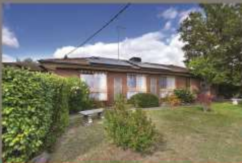
8 Semmens Ave, Creswick

Experience the epitome of elegance and convenience in a world-class setting. Creswick's Best Selling Team.